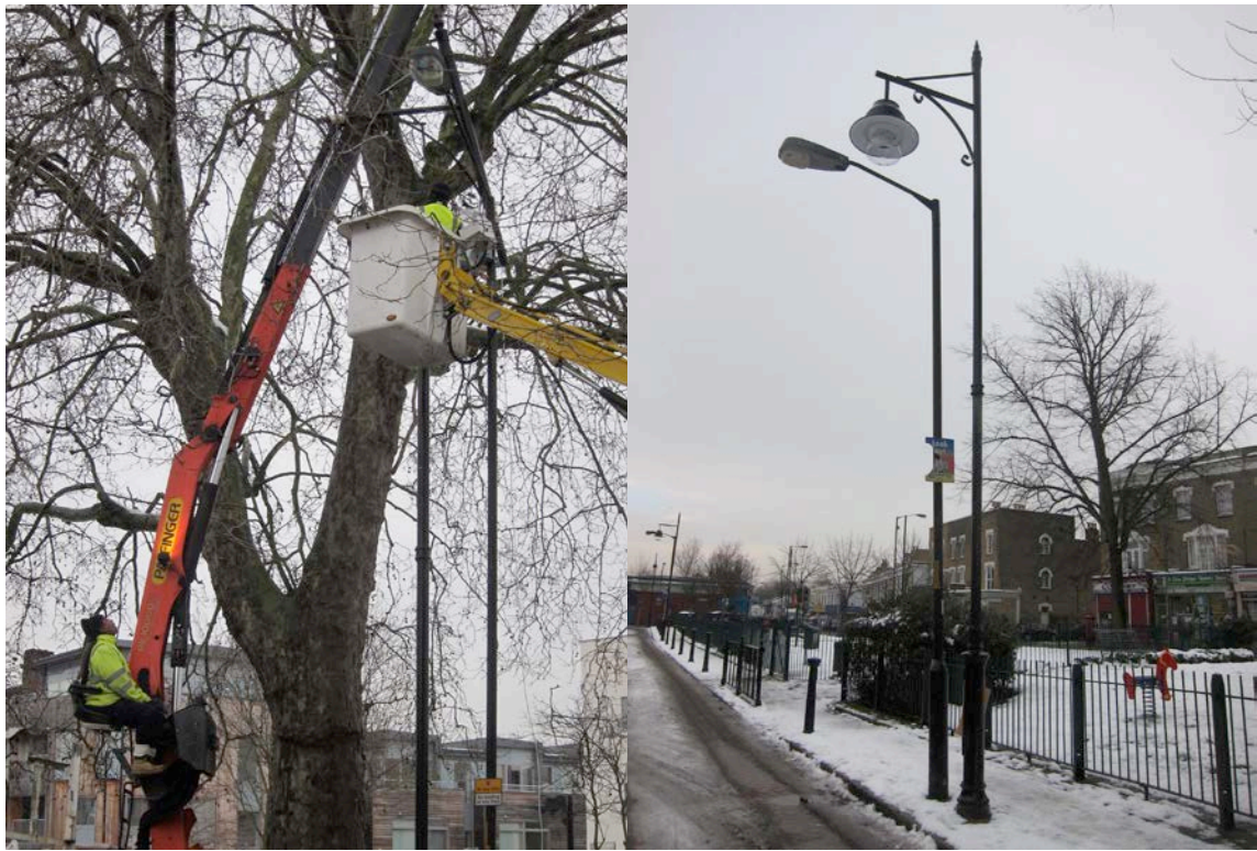
Lighting going in around Nunhead Green