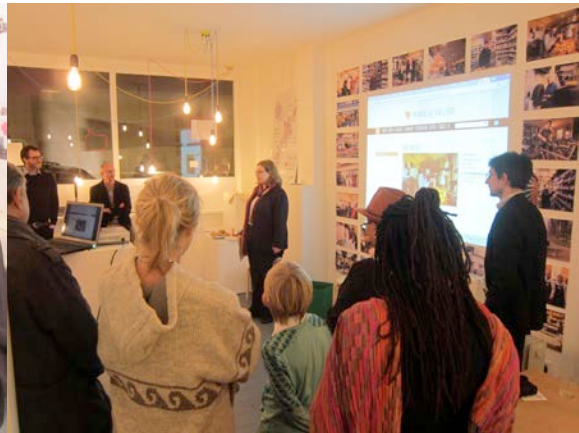
Cabinet Member for Regeneration Cllr Colley talks about the Nunhead regeneration programme